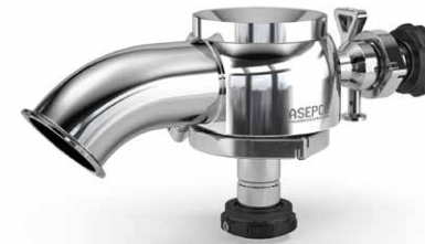
ASEPCO Radial diaphragm Sterillite valve