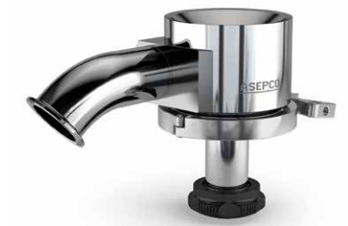
ASEPCO Radial diaphragm tangential valve