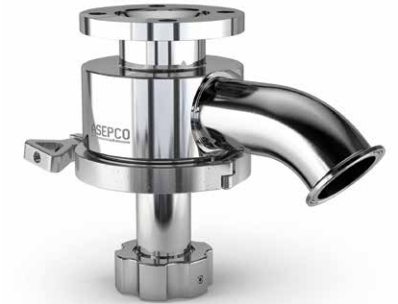
ASEPCO Radial diaphragm retrofit valve