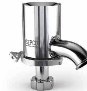
ASEPCO Radial diaphragm insulate valve