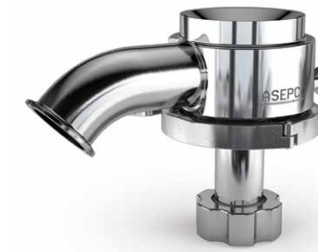
ASEPCO Radial diaphragm tank-bottom valve

Valve sizes: 0.5", 1.0", 1.5", 2.0", 2.5", 3.0", and 4.0"