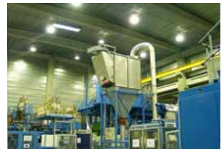
Dust collector in car tank factory

063002150 May 2011 Rights reserved to modify technical specifications.