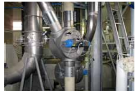
Drum-type diverter valve in pneumatic conveying system