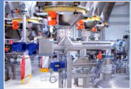
Bin activators and precision screw feeders