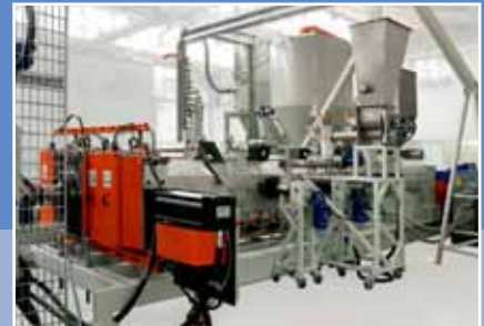
Micro-batch feeders on top of extruder