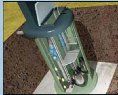
Dedicated Controls are ideal for network pumping stations, allowing reliable control of six pumps and a mixer