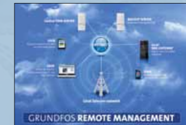
Receive input and control your pumps via your computer, mobile phone, or over the Internet