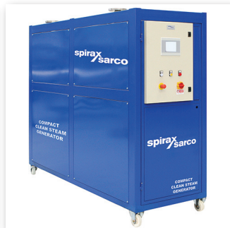
2. Clean steam generators