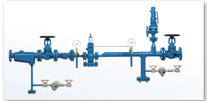
7. Pressure reducing station

Pre-assembled stations including matched products to condition the fluid prior to controlling its temperature, pressure etc., or measuring its flowrate. Includes all necessary downstream products.