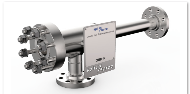
5. Steam Jet Thermocompressor