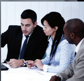
Customer focused solutions partner