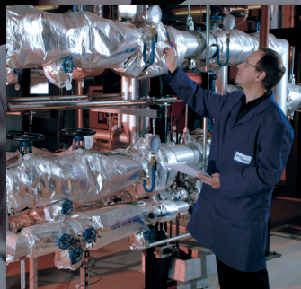
Ready assembled control systems