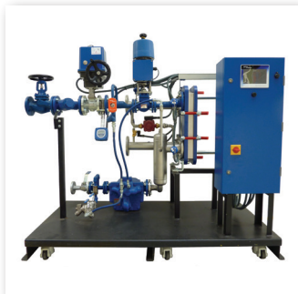
1. Compact standard heat transfer packages

We offer configured solutions, with flexible modularity to suit various systems, helping to reduce capital costs. Spirax Sarco heat recovery solutions enable users to recover usable energy from various sources; boiler blowdown, flash steam, and more. These packages provide improved efficiencies, and subsequently financial benefits such as attractive return on investment, and short payback periods.