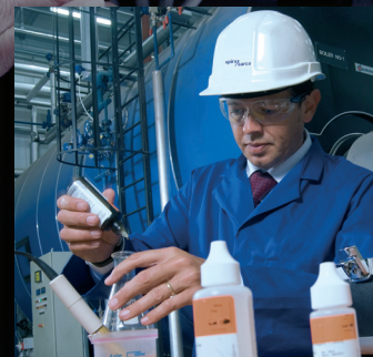
Steam condition monitoring