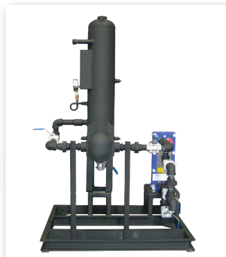
3. Heat recovery packages