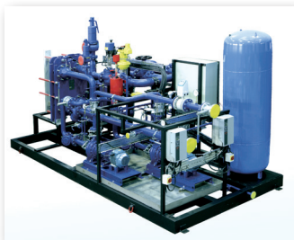
2. Custom heat transfer solutions