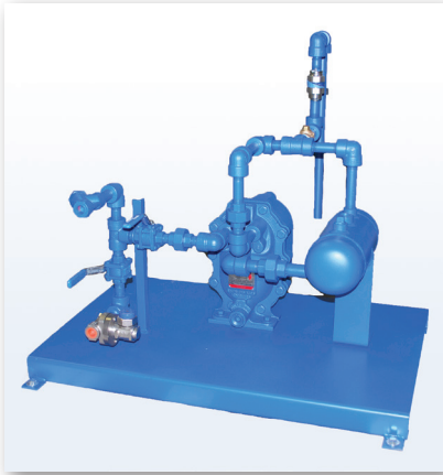
6. Pump and pump trap packaged solutions for condensate management

Condensate pumps with steam trap and / or receiver for the effective removal and return of condensate.